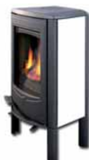
Off-white ceramic side panels Réf PJ/GPI BM