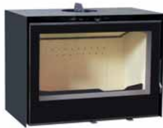
I800P ■ Ref.: I800P