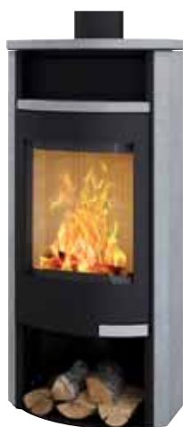
MAGELLAN ■ Ref.: PMAGOL