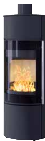
PANAMA ■ Ref.: PPAN