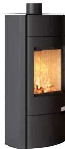
BOSPHORE ■ Ref.: PBOS