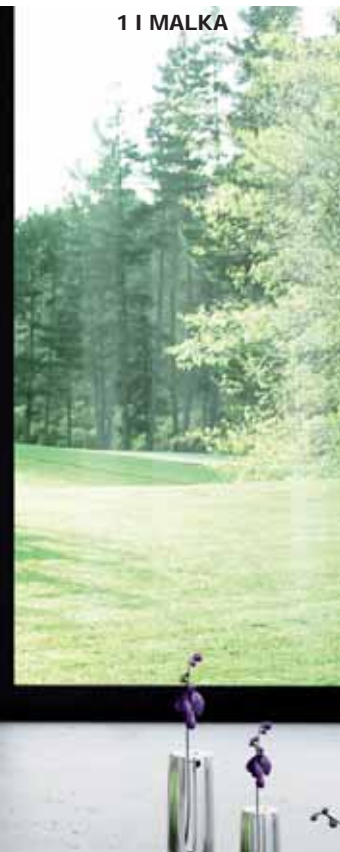
1 | MALKA