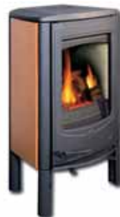
Terra d'Orient ceramic side panels Réf PJ/GPI TO