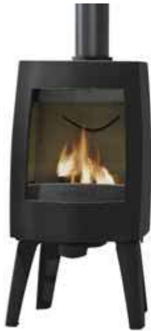
EMERAUDE 1 ■ Ref.: PEM1/N