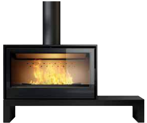
I1000P U metallic bench ■ Ref.: SECMI800P