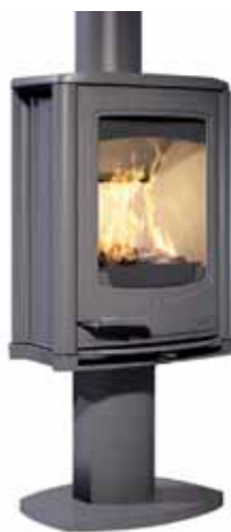
JADE on a pillar foot ■ Ref.: PJ/GPI