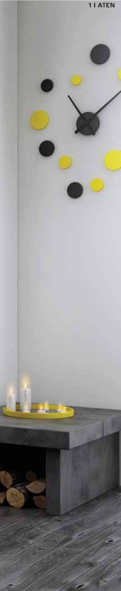
1 | ATEN