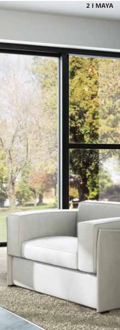
2 | MAYA