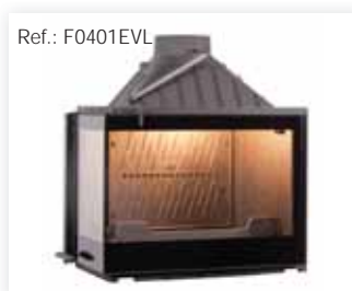
EUROPA 7 EVOLUTION VL