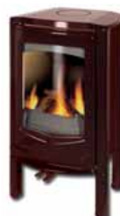
Brown enamel Réf PJ/M