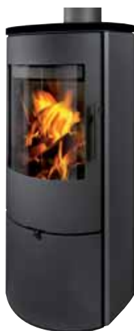
GIBRALTAR ■ Ref.: PGIB2