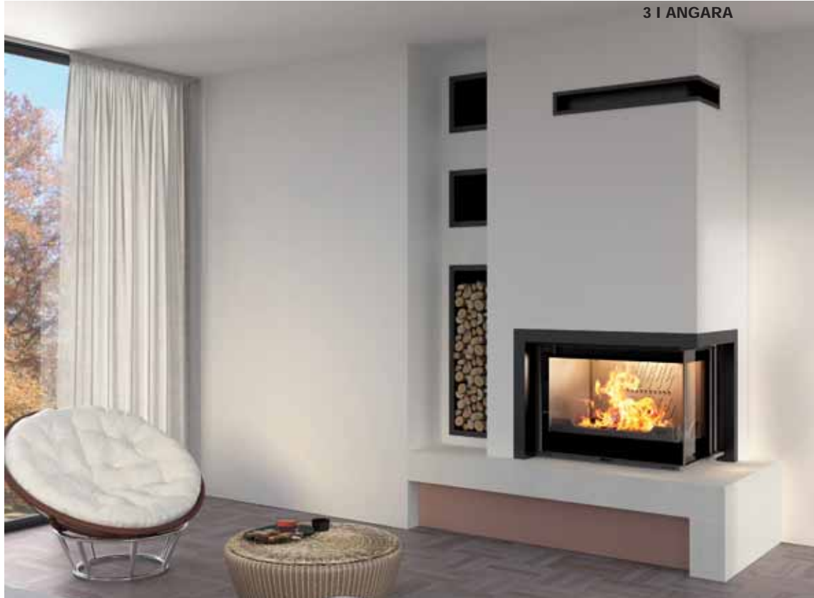
3 | ANGARA