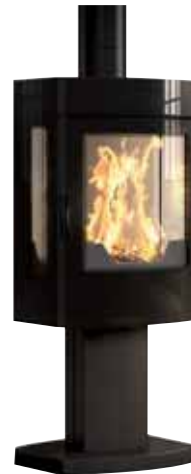
AMBRE silkscreen printed glass ■ Ref.: PA/SR