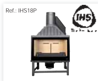
VISIO 8 PLUS IHS