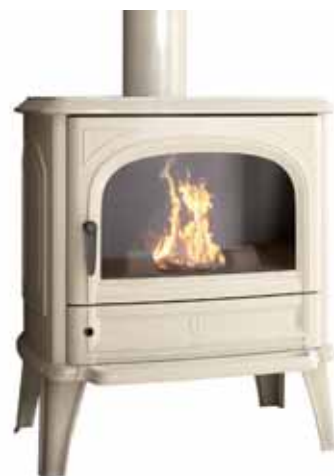
SAPHIR ■ Ref.: PS/C