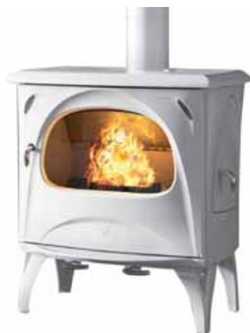
AUORE ■ Ref.: PAUR/B