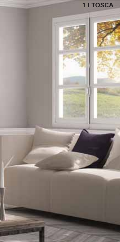
1 | TOSCA