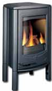
Grey paint - Réf PJ/G