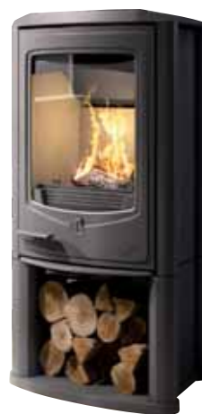
JADE with a log box ■ Ref.: PJ/GBU