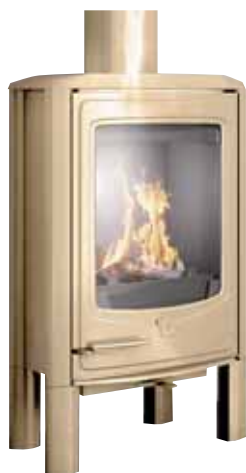
JADE ■ Ref.: PJ/C