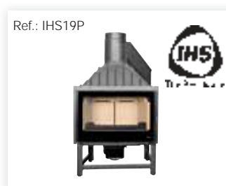
VISIO 7 PLUS IHS