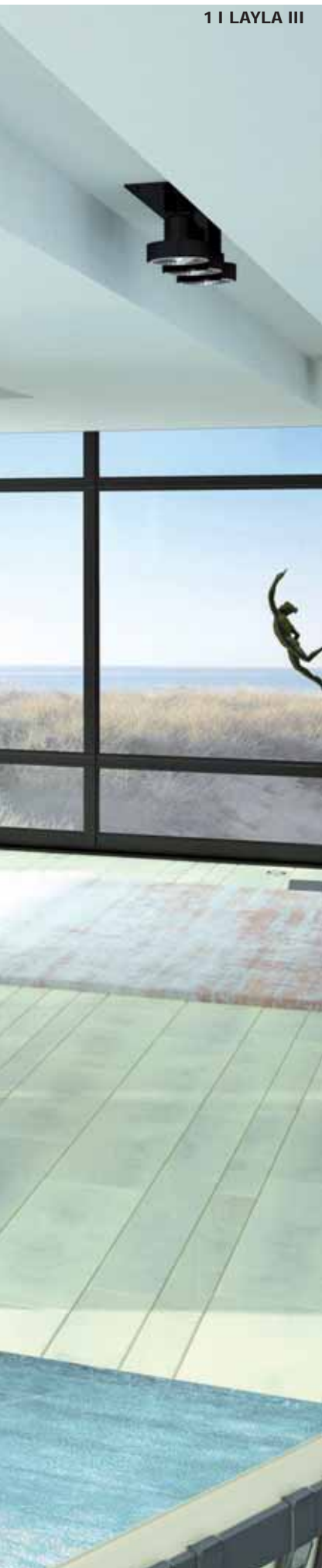
1 | LAYLA III