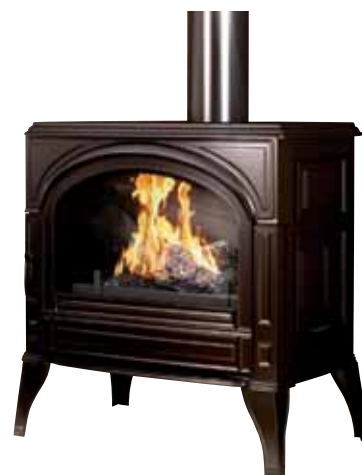
TOPAZE ■ Ref.: PT/M