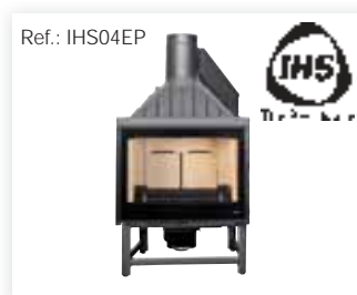
EUROPA 7 EVOLUTION PLUS