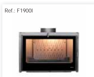
VISIO 7 INSERT