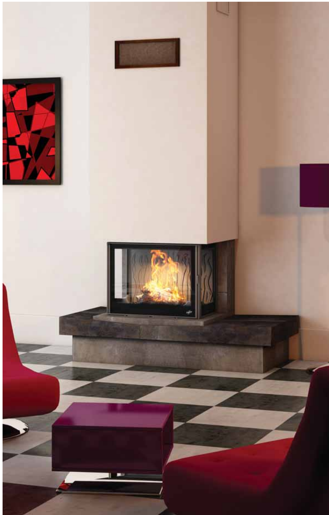
ELKO ■ Ref.: C01E02 Front-view firebox on base. Softened and polished concrete. Model presented with EUROPA 7 EVOLUTION 3 SIDES «BLACK LINE» firebox.