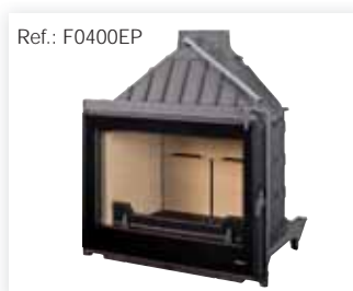
EUROPA 7 EVOLUTION PLUS