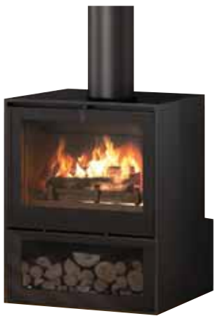
I700P log box ■ Ref.: S-BI800P