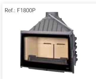
VISIO 8 PLUS