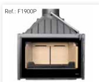
VISIO 7 PLUS