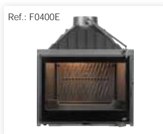
EUROPA 7 EVOLUTION