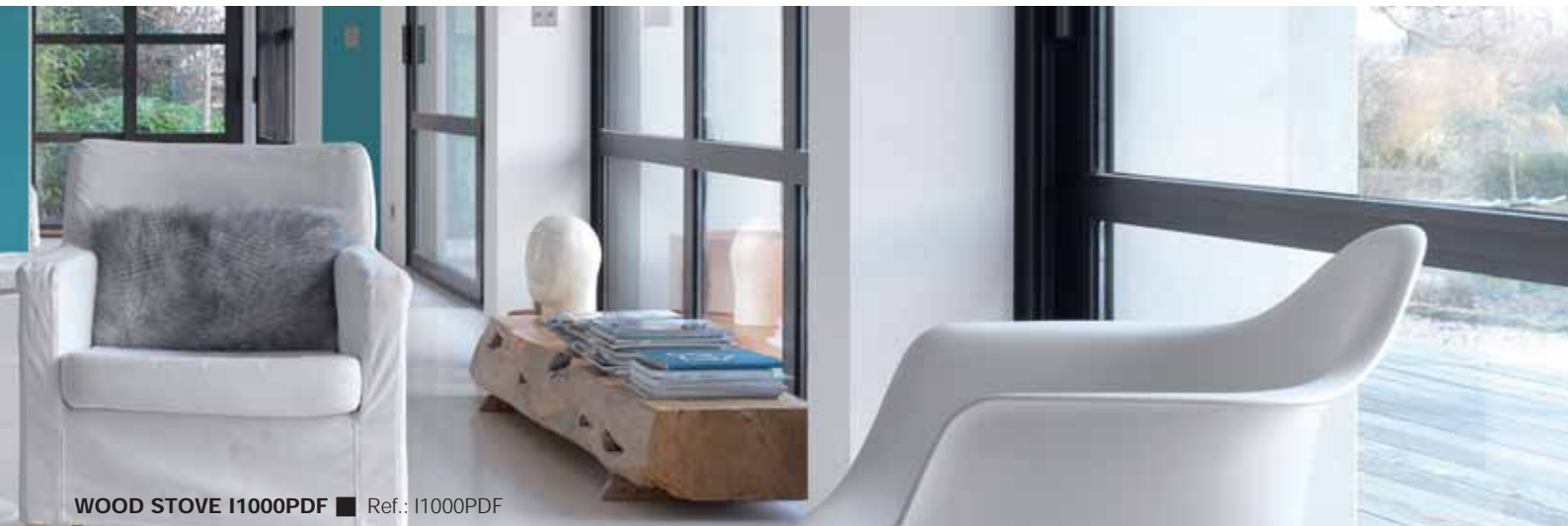
WOOD STOVE I1000PDF ■ Ref.: I1000PDF